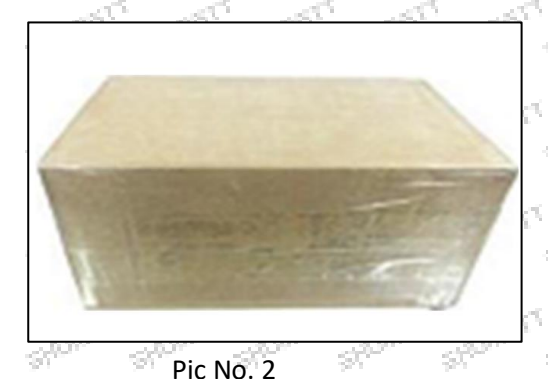
Domestic express packaging:

Minors are prohibited from using transparent tape, yellow tape, black wrapping protective film, and white wrapping protective film to avoid personal injury.